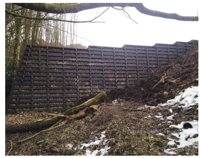
Soon after construction demonstrating how TensarTech ^{\odot} EcoCrib ^{\bowtie} suits site conditions.

TensarTech<sup>®</sup> EcoCrib<sup>™</sup> was chosen due to the rapid construction that requires a minimal foundation.