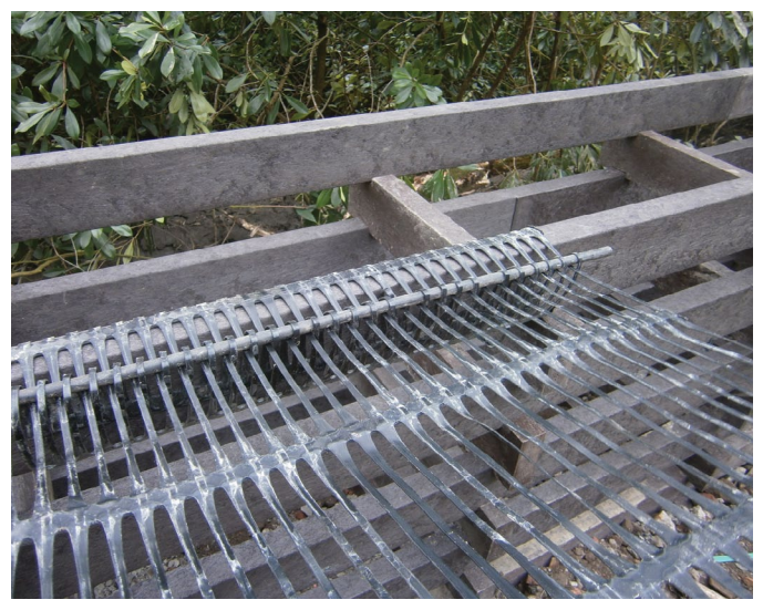
Tensar bodkin connectors offer high efficiency connection between crib stretcher and Tensar geogrid.