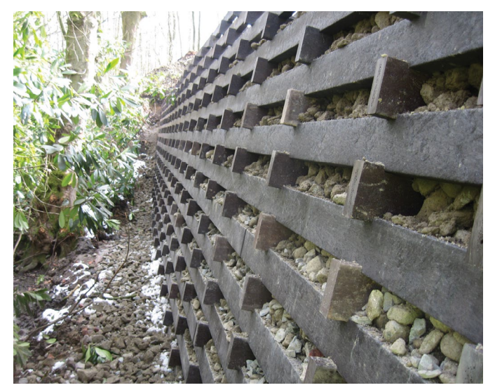
The EcoCrib<sup>™</sup> facing offers an aesthetically pleasing and durable facing that blends into the natural surroundings.

The TensarTech<sup>®</sup> EcoCrib<sup>™</sup> System supplied as part of a Design and Supply package that includes EcoCrib facing, Tensar uniaxial geogrids and Tensar bodkins can when requested include an indemnified design that includes construction drawings and construction advice on-site via our UK civil engineering team. Although Tensar does not offer installation services, we can supply a list of installers who work countrywide on Tensar projects.