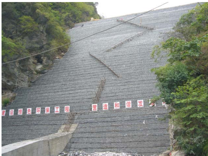
Figure 4: Finished Slope at 66m high