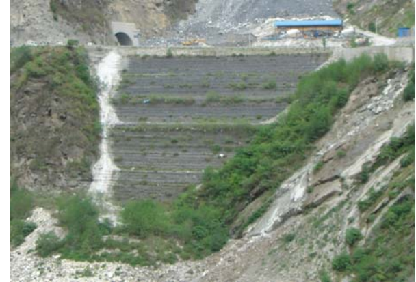
Figure 1: Jinping Mianshagu Slope