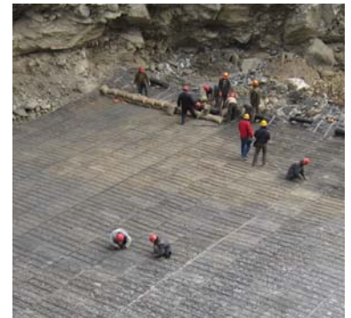
Figure 3: Start of construction